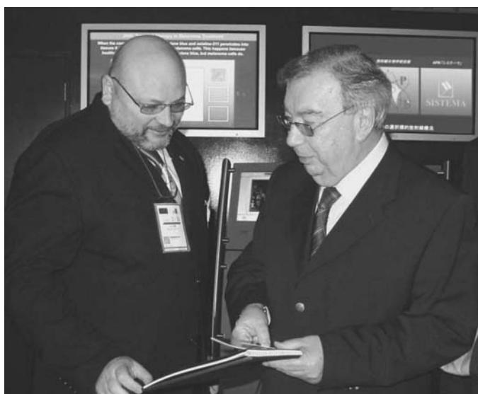
Nagoya (Japan), March. President of the RF Chamber of Commerce and Industry E. Primakov (right) at the JINR exposition at the World Exposition EXPO-2005