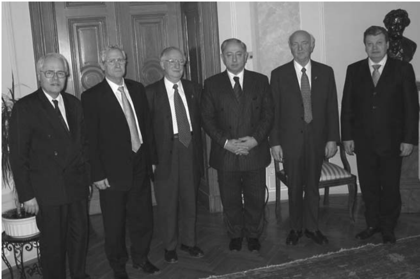
Budapest (Hungary), 29 January. Participants of the signing of the Agreement on cooperation of the Hungarian Academy of Sciences and JINR