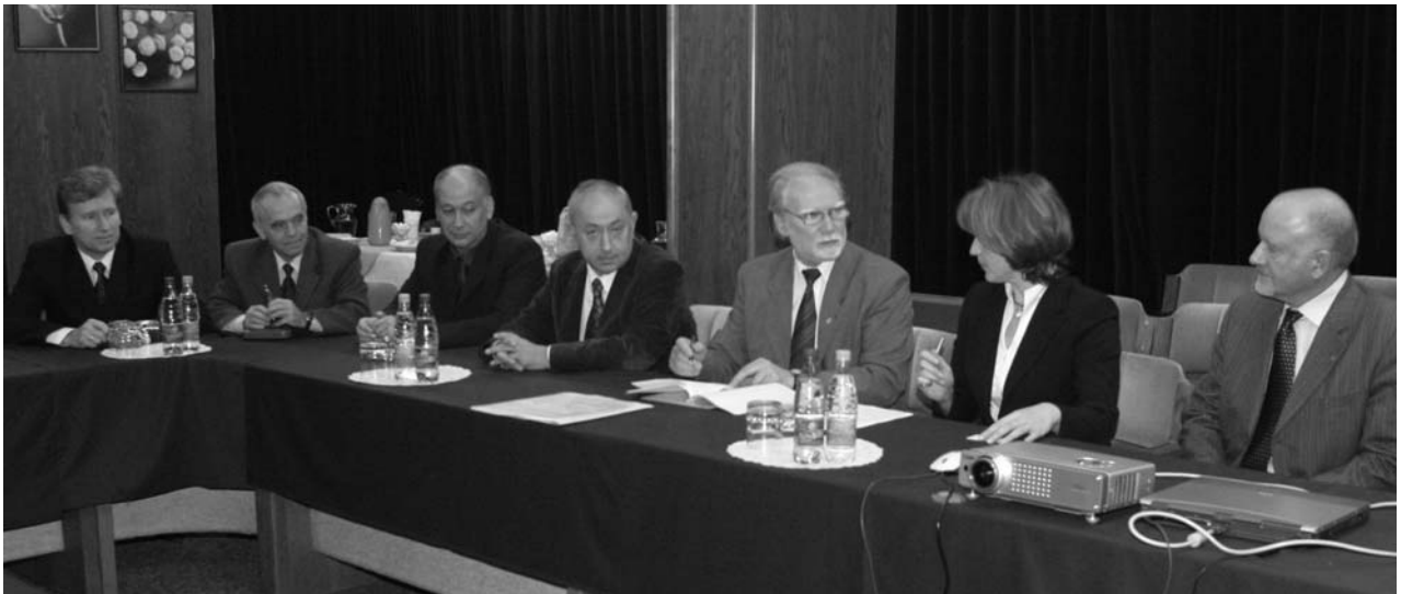
Dubna, International Conference Hall, 6 October. Signing of an Agreement on cooperation between JINR and the OAO Komstar – Obyedinennye TeleSistemy