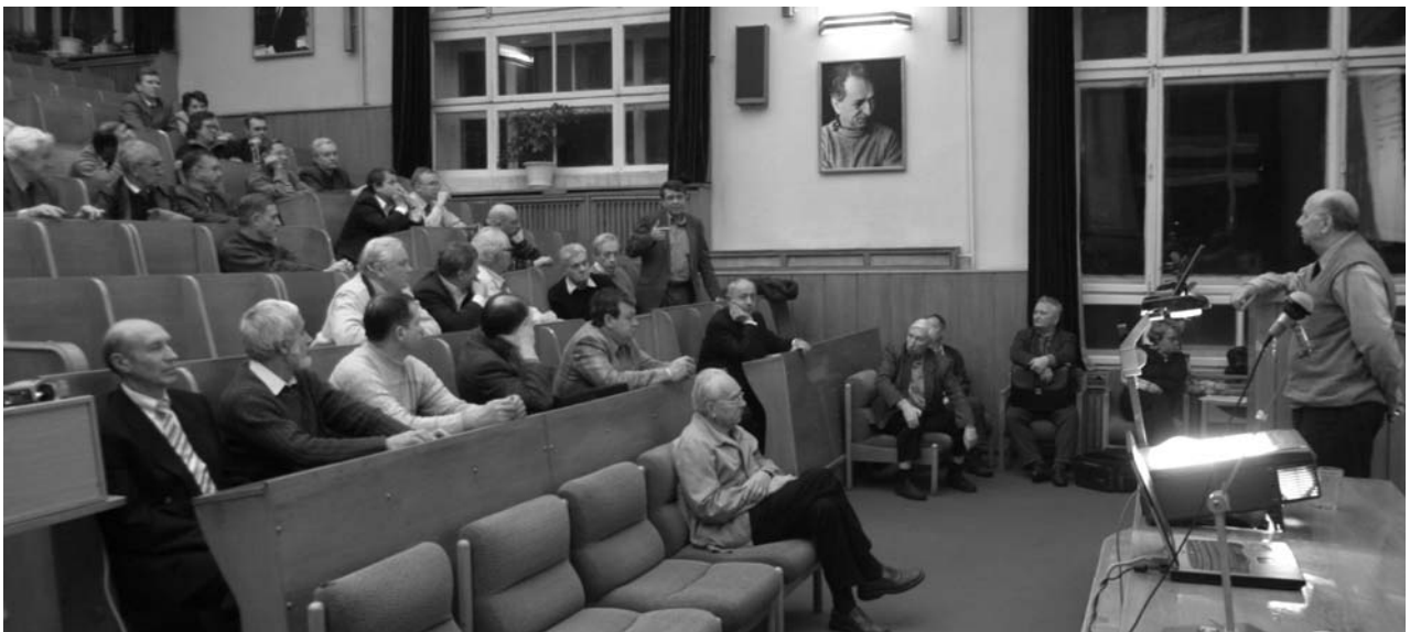
Bogoliubov Laboratory of Theoretical Physics, 23 December. The meeting of the JINR Scientific Technical Council