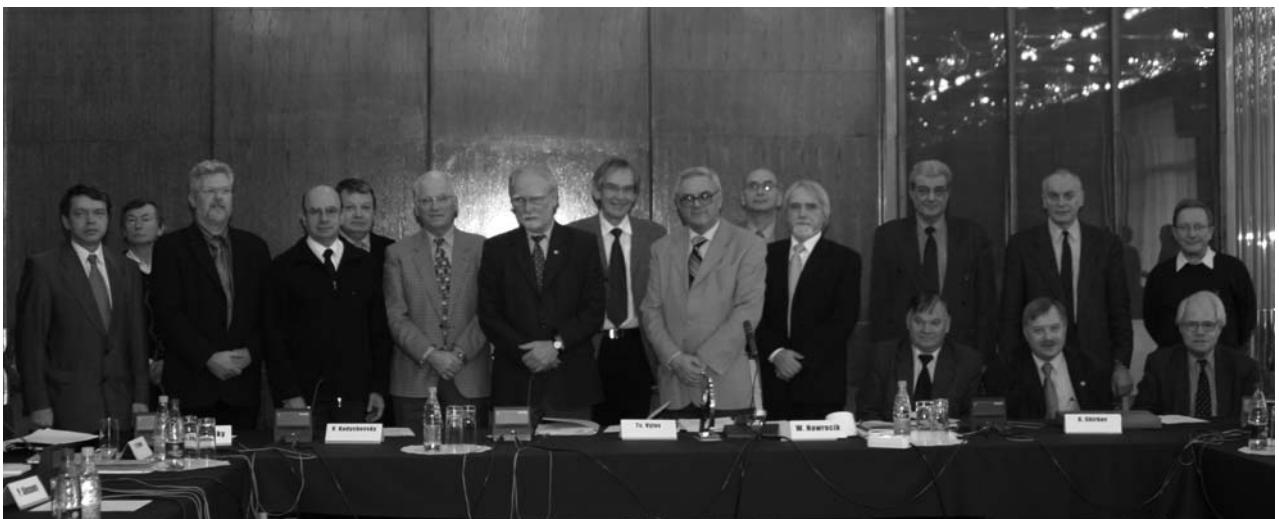
Dubna, 14 November. Participants of the session of the Programme Advisory Committee for Condensed Matter Physics