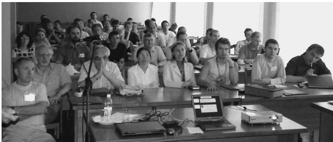
Gomel (Belarus), 25 July – 5 August. VIII International school-seminar «Actual Problems of Microworld Physics»