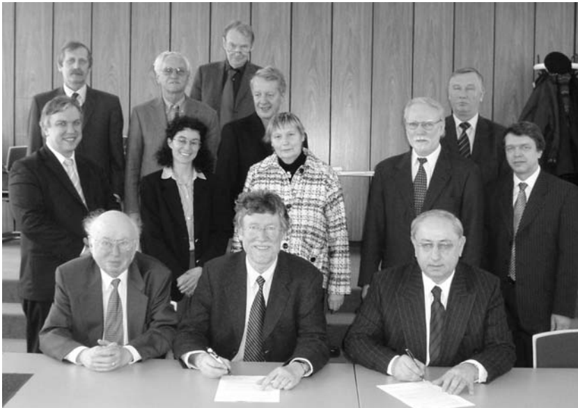
DESY (Hamburg), 22 February. Participants of the 15th meeting of the Coordination Committee on BMBF–JINR cooperation

Dubna, 27 July. US Congress delegation on an official visit to JINR. An excursion to the SPC Aspekt