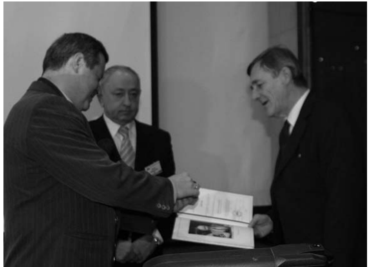
Dubna, 19–20 January. The 99th session of the JINR Scientific Council. The presentation of the Bruno Pontecorvo Prize