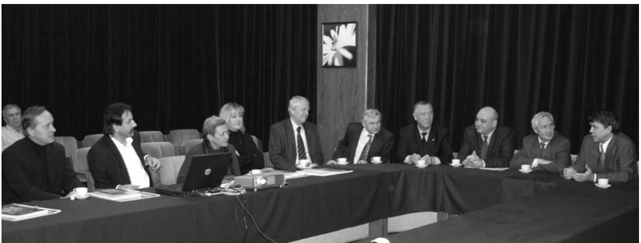
Dubna, 17 November. The delegation of the Parliament of the Czech Republic at a meeting with the JINR Directorate