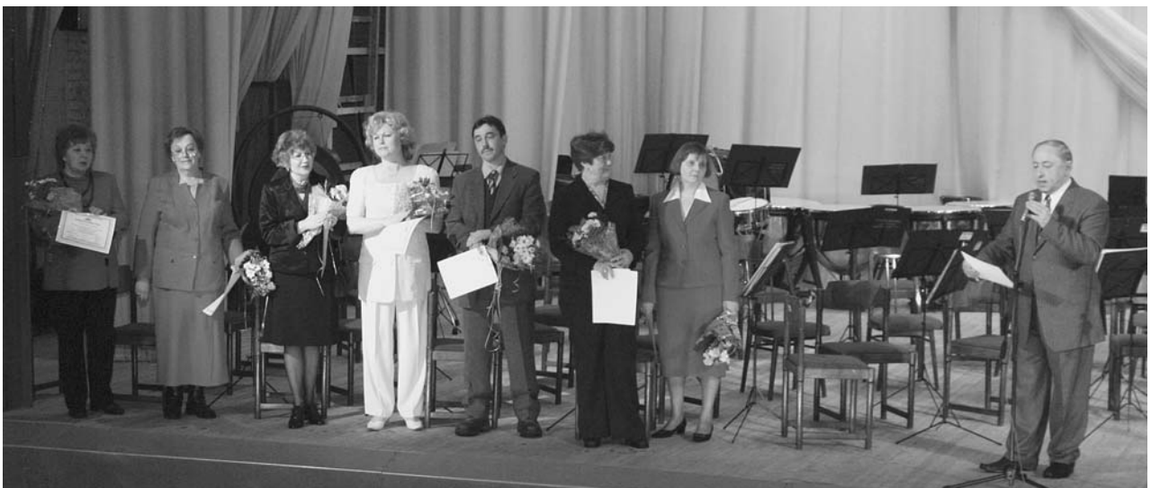
Dubna, 26 March. JINR's Organization Day. The laureates of Dubna teachers' competition — 2005 JINR grant holders