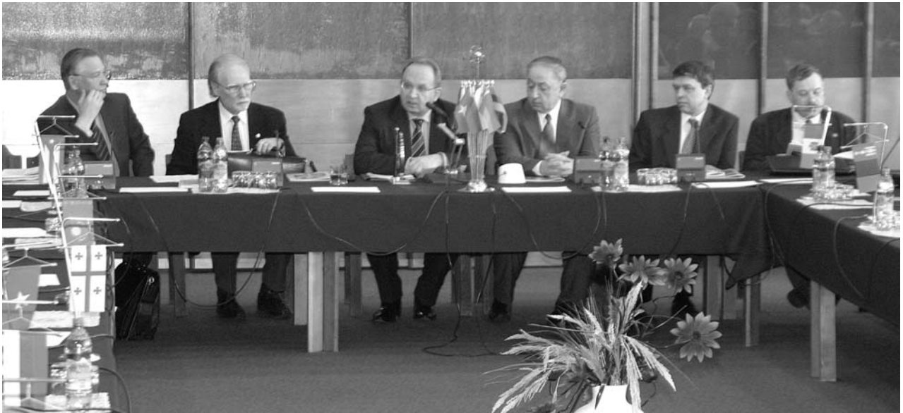
Dubna, 17–18 March. The Committee of Plenipotentiaries of the governments of JINR Member States