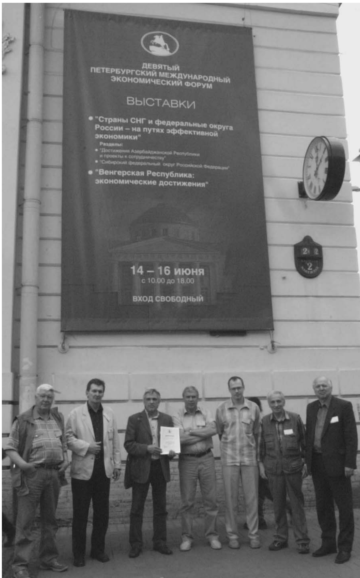
Saint-Petersburg, 14–15 June. JINR's delegation at the International Economic Forum