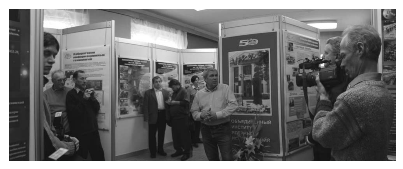
Dubna, JINR Museum, 28 March. Opening of the exhibition «50th Anniversary of JINR: Stages of Development and Major Scientific Achievements»