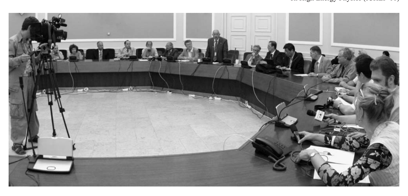
Moscow, 27 July. A press conference upon the opening of XXXIII International Conference on High Energy Physics (ICHEP'06)