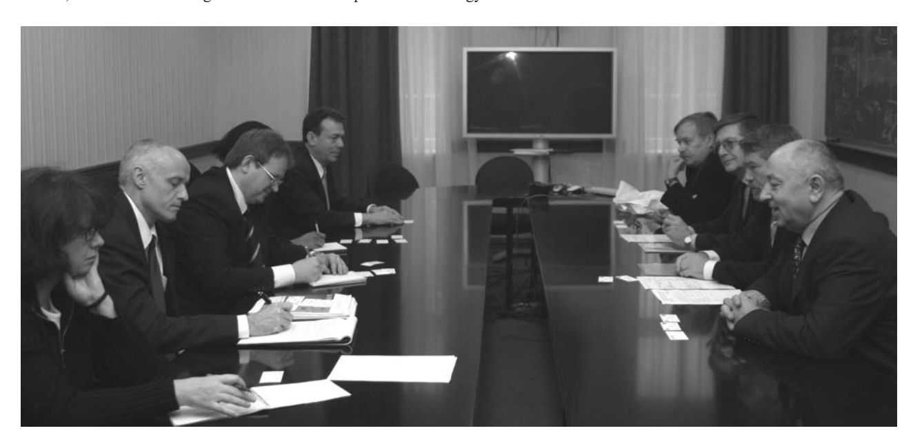
Dubna, 4 December. A delegation from the US Department of Energy on a visit to JINR