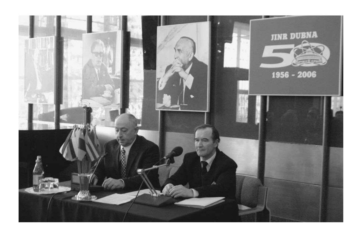
Dubna, 25 March. Presentation of letters of congratulation and souvenirs and awarding of JINR staff members on the occasion of the Institute's jubilee