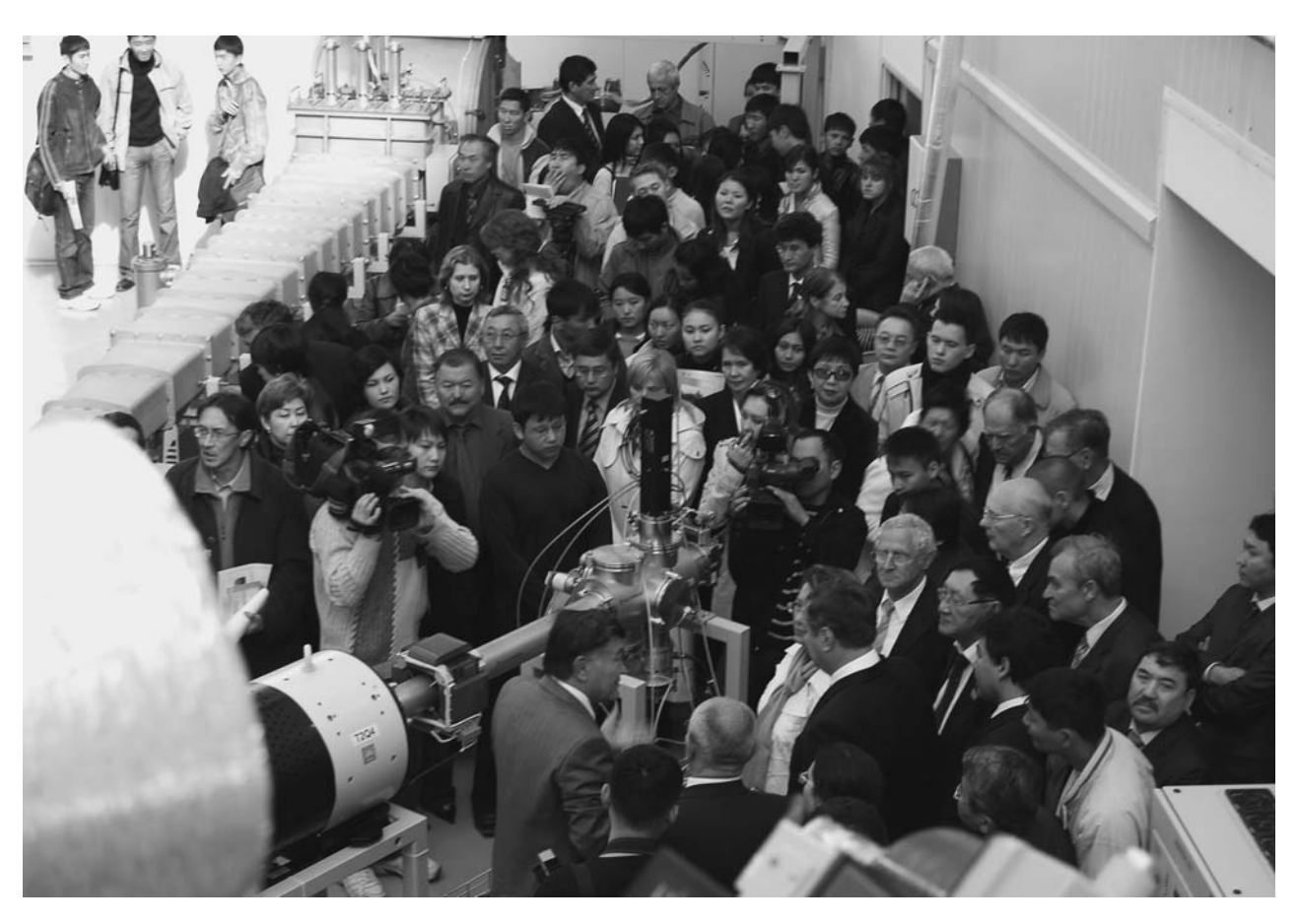
Astana (Kazakhstan), 21 September. The inauguration ceremony of the Interdisciplinary Scientific Research Complex on the basis of the DC-60 heavy ion cyclotron at the Gumilev Eurasian University